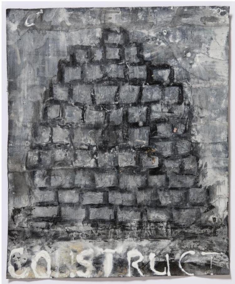
Chris Doris_Who Goes There, A4 sandpaper work (detail of installation, 200 elements)